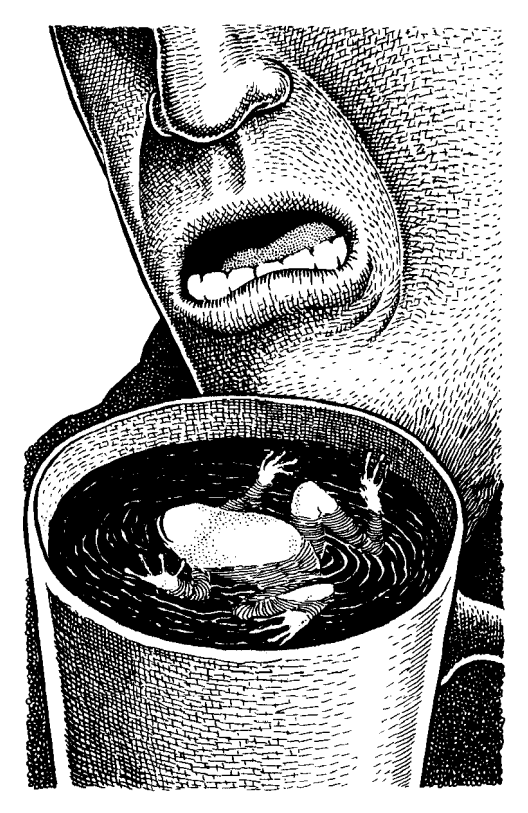
Another frog was floating lifelessly on its back in a silver cup of Pharaoh's favorite beverage.

"This Moses and Aaron," spoke up another named Jambres, "are not truly skilled