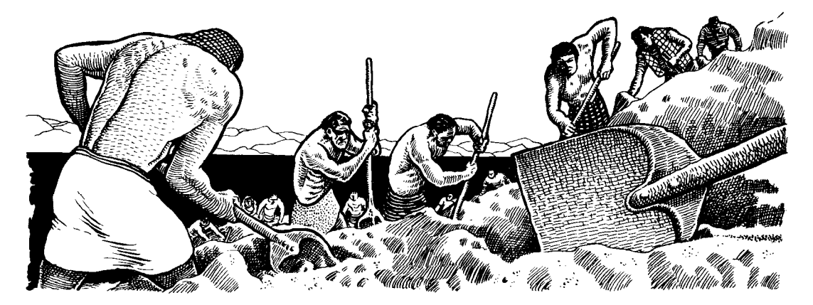
The Egyptians feverishly dug into the river banks in search of springs of clear water.

In spite of all the misery in the land, Pharaoh stubbornly refused to change his mind about the Israelites. However, as the week went on, he began to wonder if the discomfort of his people was too high a price to pay to keep the Israelites as slaves. At the same time Pharaoh and those about him were not as miserable as most other people, because every effort was made to supply clear water to the royal family. But Pharaoh knew that the nation couldn't last long under those conditions. He realized that sooner or later he would have to give in and call for Moses and Aaron.