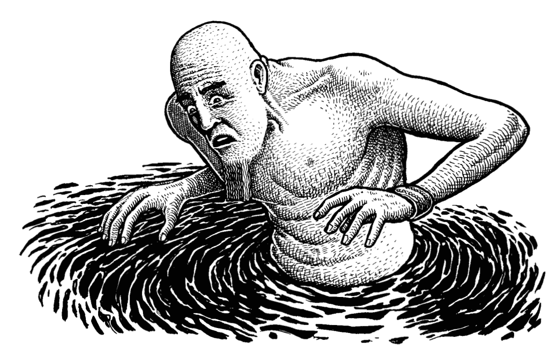
The King stared down at the water; it was turning red!

It was difficult for Pharaoh to regain his dignity and calmness. But he knew he must do so before his servants. Furthermore, he felt that he had to prove that the two Israelites